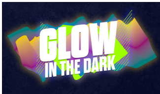
5 Weeks on Easter