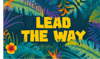
4 Weeks on Moses