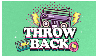
4 Weeks on Jesus' Teachings