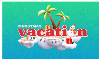
5 Weeks on Christmas