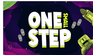
4 Weeks on the Early Church