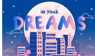
4 Weeks on Joseph