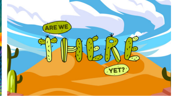
5 Weeks on Israel & the Wilderness