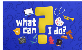
4 weeks on Jesus' Early Life and Ministry