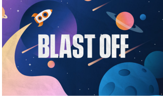
4 Weeks on Spiritual Habits

This year, here are the series we'll be covering in Grow Kids . . .