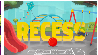
5 Weeks on Judges, Ruth, & Samuel