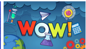
4 Weeks on Jesus' Miracles