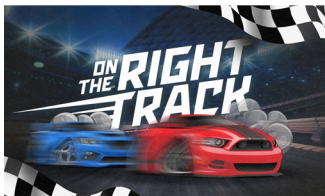
4 Weeks on Joshua